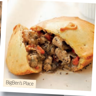
Big Ben's Place