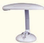
Table Lamp 3,800pts or 2,600pts + $10

Pyrex Set (set of 3) 4,200pts or 2,500pts + $13