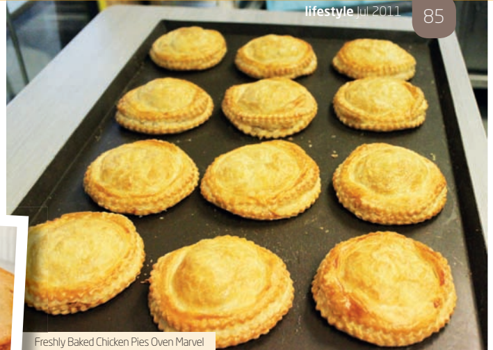
Freshly Baked Chicken Pies Oven Marvel