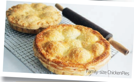
Family-size Chicken Pies