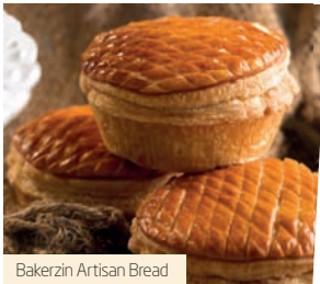
Bakerzin Artisan Bread