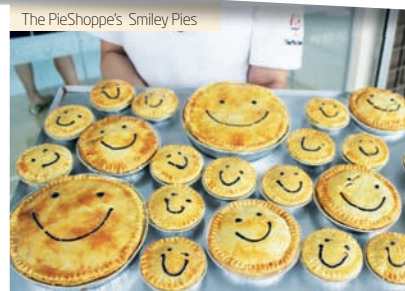
The PieShoppe's Smiley Pies

Few would argue the British claim to being the ultimate exponent of pie making. During our days as a British colony, they introduced many classic British dishes to the Singaporean palate including the chicken pie.