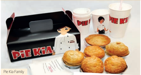
Pie Kia Family